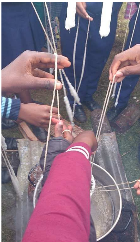
Making candles in the Mpophomeni Time Travel.

Unlike Oral History, this method is specifically designed for communicating heritage. One major difference between Oral History and Time Travel method is that all are learners in Time Travel in contrast to Oral History where one person is most often sharing her/his stories. While the various initiatives during and after Apartheid to prepare for change and to break the barriers of hatred and suspicions have not been evaluated for efficacy, it is correct to say that the seeds have been planted. One can see that such initiatives were in service of the society. A chance to know the other person through the use of Time Travelling reduces the sus-