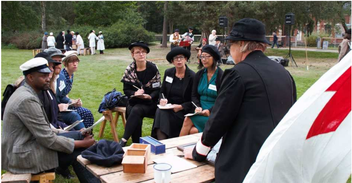
Time Travel on migration and taking care of refugees, Kalmar in 1945. Discussions on identity, diversity and integration.

These issues are intimately connected to the link between collective and individual identities. Diversity and pluralism generate a number of diverse individual cultural heritage and identity projects. These become manifest in society through demands for recognition and acceptance (such as the right to citizenship), in distancing