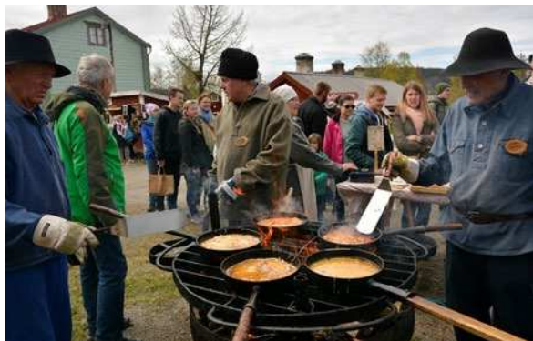
One of the favorite tasks of volunteers is to cook “kolbul-lar”, pancakes, during Jamtli’s various events.

reminiscence impact in the third age the value it has when activating life time competences. The life time competences may be as important in third age as in later life. The individual memories are as important for life quality in third age as in fourth age, but of course in a different way. When individual memories are triggered in fourth age we often just look at this as a way to possibly improve the conscience of the individual about here and now. For the individual in third age the time traveling to earlier memories is more like re-activating competences related to the memories. This makes the use of time traveling in volunteering re-enactment especially interesting and worth further research.