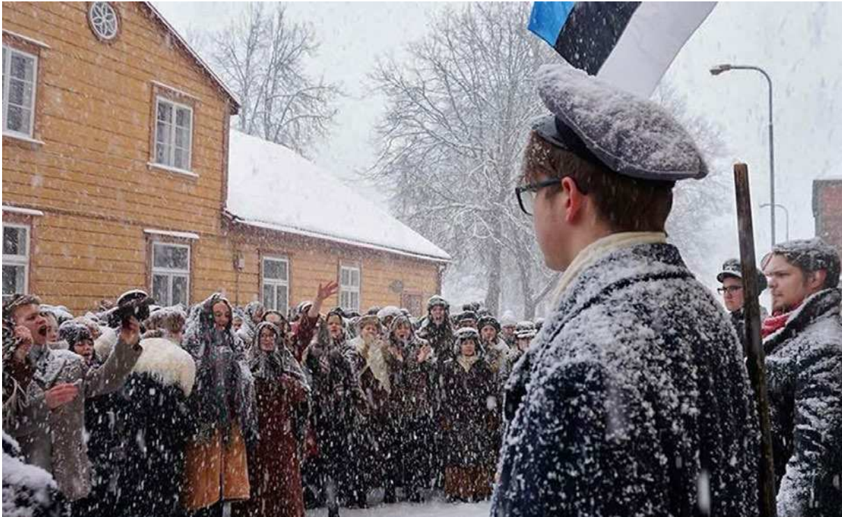
All schools in Viljandi gathered in the cold February morning next to the court house. In this court house the “Manifest to all nations of Estonia” was declared in February 1918.