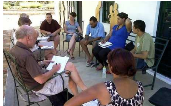
A Time Travel group meets to prepare for an event, Clanwilliam, South Africa.

The Time Travel event is the actual role-play at the historical site in the community, located close to a school. It is one story, one event, one site and one particular day/year.