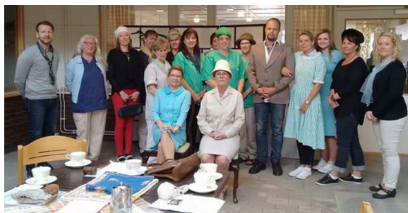
Staff at the elderly home Rönningegården in the Time Travel event to 1967. The focus was on “change”.

The meeting in the church committee was led by a very dominant and mean chairwoman with old fashioned ideas and opinions. She pointed out