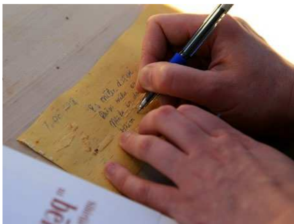
Writing on birch bark. Photo from a Time Travel event.