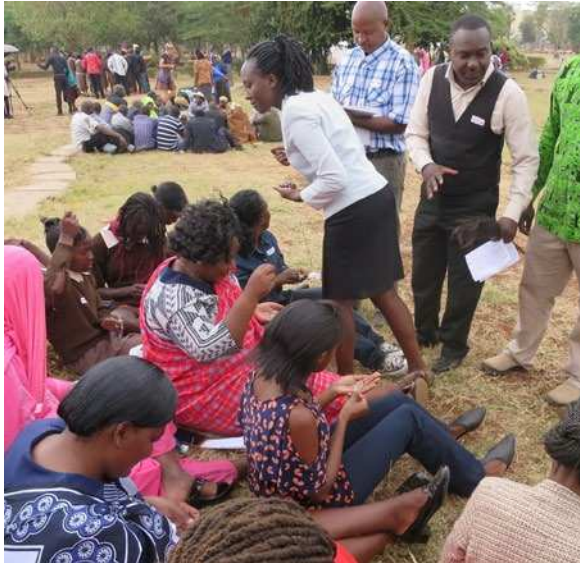
More than 40 ethnic groups and one nation. Time Travel to 1962, on the eve of independence in Kenya, focus on diversity and cohesion.

within the character of the nation as perceived by the dominant society (Castles & Davidson 2000; Beeson & Bisley 2010).