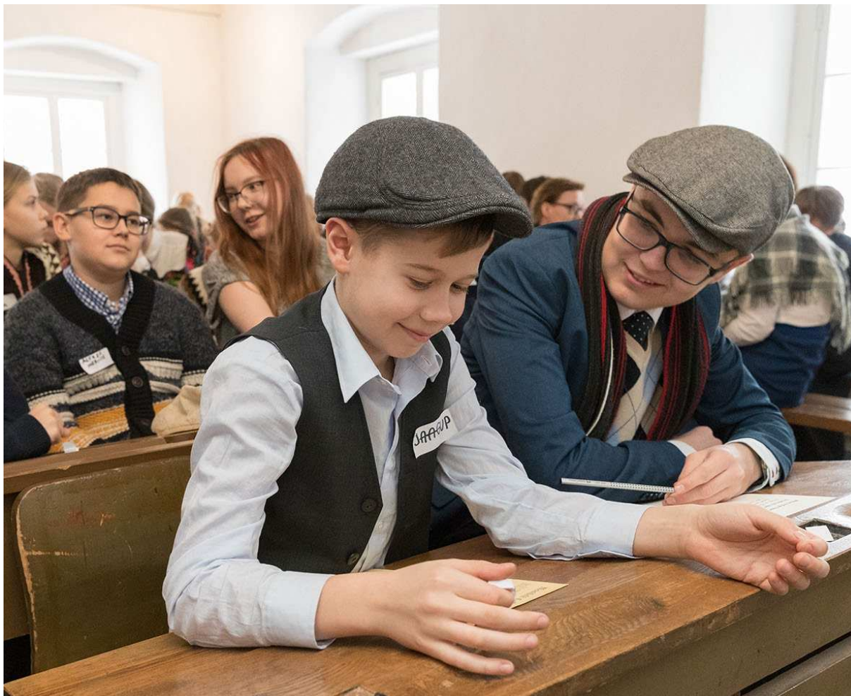
Students discussing the manifest in the Time Travel to 1918 at Heimtali Museum. “An Estonian republic – for everybody?”.