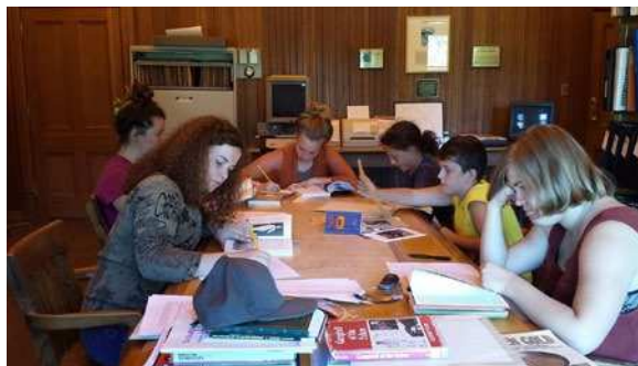
Yukon Time Travel students researching their characters in the Dawson City Museum archives.

These and other thought-provoking questions inspired students to think more critically about their current world while gaining a better understanding of the past. These Time Travels inspired students to use their knowledge of history as a tool for negotiating the current world.