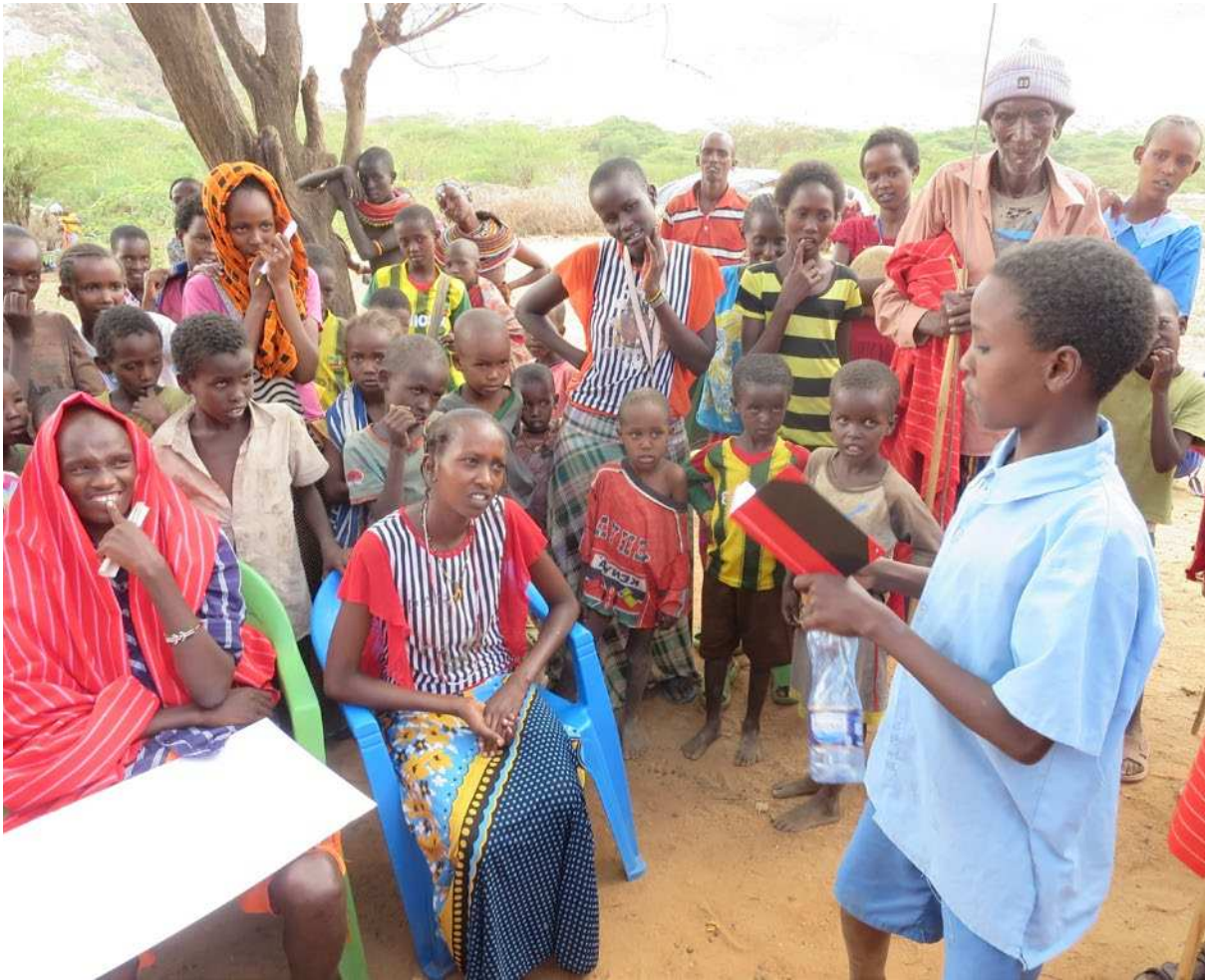
Morals and values are discussed in a Time Travel in Ngurunit, Kenya. Shall we keep the traditions on gender and circumcision?