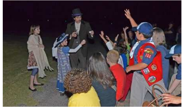
Time Travel event with snake oil salesman 1882, during Ghosts of the Past event.