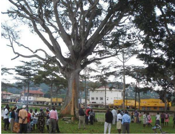
Change in society? Time Travel to 1954, to prepare for independence, at the Freedom Tree, Entebbe, Uganda. Inspiration for changes in today's society?

derstanding of the theoretical foundation on which heritage works to build futures (e.g. Högberg et al. 2018). This is a topic that Ebbe constantly refers to when we work together. Here, I will touch upon a selection of topics I see as essential contributions to the future development of the Time Travel method, given that the ambition of applying this method in heritage education is to bring about a change in society. These topics are migration, permanence and movement, complexity, collective and individual heritage and citizenship and heritage (see Högberg 2013, 2015, 2016 for additional examples).