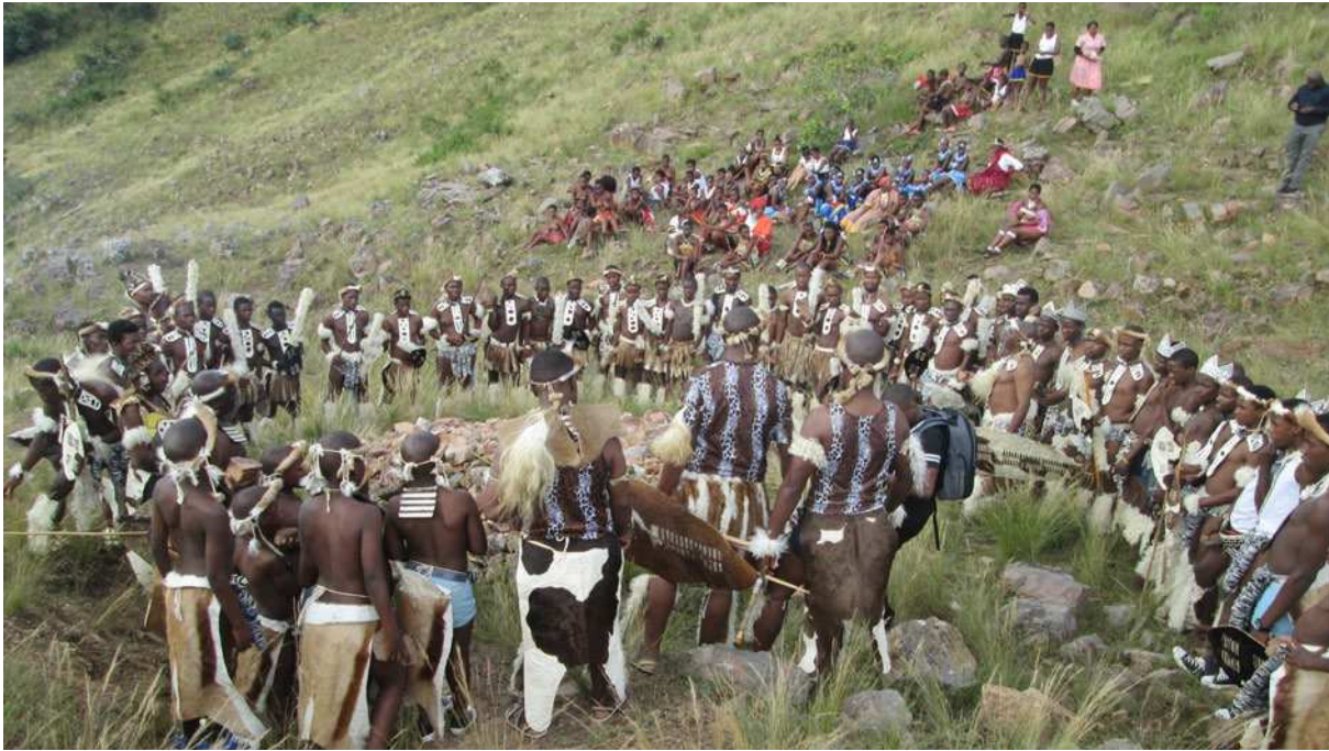
King Shaka Time Travel at Mtwalume, when the Zulu King stopped there for a couple of days in 1828. War or peace? This Time Travel has become a tourist event with thousands of participants.