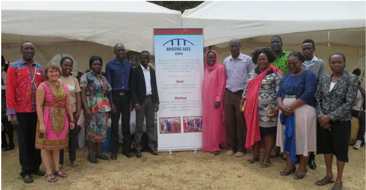
Launch of Bridging Ages Kenya at Uhuru Gardens, Nairobi, November 2016.

A bull would be slaughtered and its blood collected and sprinkled into the air as a way of binding the community to the peace covenant. As a gesture of reconciliation the whole group would eat the meat together. Thereafter, feasting, singing, dancing and celebration would continue for several days. The whole society would thus be part of the agreement and anybody who violated it could suffer some calamity. I see a need to borrow from