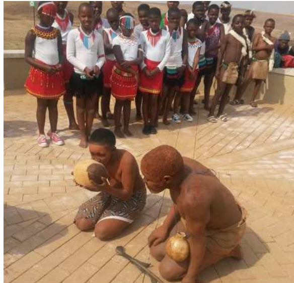
The hunter-gatherers testing the farmers' food. Time Travel in Ingula.

the recognition of the knowledge the indigenous people had and used to survive in their environment before the introduction in Southern Africa of the Western school education. The Time Travel held on the Drakensberg Mountain on the site of the Ingula Dam is a good example, which envisions the meeting of the Hunter-Gatherers (San people) and the Farmers (Nguni people). It was organized jointly by the Siege Museum of Ladysmith and two nearby schools. The event included the mathematics used by the Hunter-Gatherers in the building of their huts with portable basic material of grass and branches, it included the type of material used in making the bow and arrow including the poison mixed for the immobilization of the varied sizes of hunted animals and it included the relocation to the site of the animals brought down in the case of them being too big to carry. The lessons learned in the Time Travel were manifold but the central one was that one learns from other people to survive in a new place. This form of Time Travel shows how people in South Africa used to govern themselves before the arrival of the Europeans; how they lived, produced food, raised children and used the environment. This particular Time Travel had the benefit to expose participants, especially the primary school learners, of the dangers of xenophobic attacks directed to people from other nationalities.