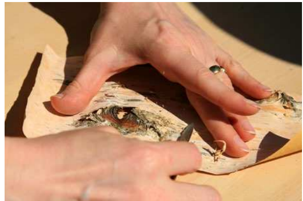
Peeling the bark from a birch tree's stem and shaving off the dry outer surface. Photos from a Time Travel event.