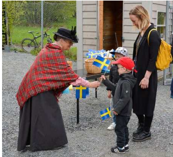
Volunteers also contribute as hosts at various events and reinforce Jamtli's service to the visitors.

The older adult becomes something else than a guest in the museum at that moment. He or she is both teacher, learner and co-producer of the experience.