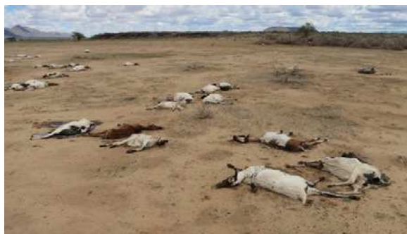
Climate change is a major challenge. Hundreds of dead sheep in the draught in Marsabit county, Kenya in 2017.

There are many challenges in today's society, extensive challenges like conflicts, war, illness, poverty, climate change, integration and inequality. There are also more personal ones like disharmony and meaning of life. The Global Goals for Sustainable Development, agreed by 193 world leaders, is a way towards a better world by 2030. In what way can heritage institutions contribute to reach these goals? Heritage is about life, in the past and today, including all the experiences, both good and bad. The Time Travel method is one way to address the challenges of today using the experiences of the past. The method can create safe spaces for people to reflect and find a way forward, to develop future heritage and future society. The Time Travel is like Soft Power, using relations and dialogue, in contrast to Hard Power