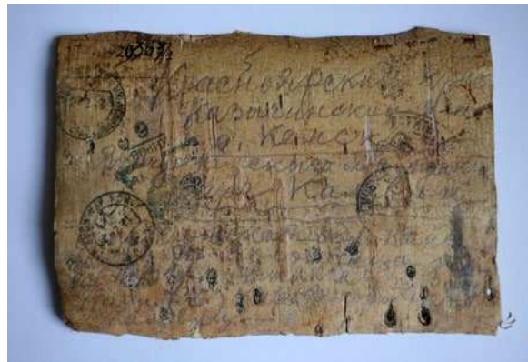
One of the 14 letters written on birch bark in Tukums museum's collection.

The mission of Tukums museum is focused on the development of the community, through providing education and entertainment for target groups. The collection of the Tukums Museum contains more than 93,000 objects, including outstanding artistic, cultural and historical objects that describe changes in the Tukums Administrative District and its cultural environment over the past 2,000 years. Some of them are related to the Soviet repression of the Baltic countries during the middle of the 20 th century. One of these collections, which consists of 14 letters written on birch bark in Siberia and about 300 letters written on paper as well as drawings, photos and other objects, was used by educators of Tukums museum in order to negotiate a difficult heritage related to a painful past. Tukums museum is a leading institution in safeguarding the collection “Letters written on Birch bark in Siberia” included in the Latvian National Register of the UNESCO Memory of the World programme. 1