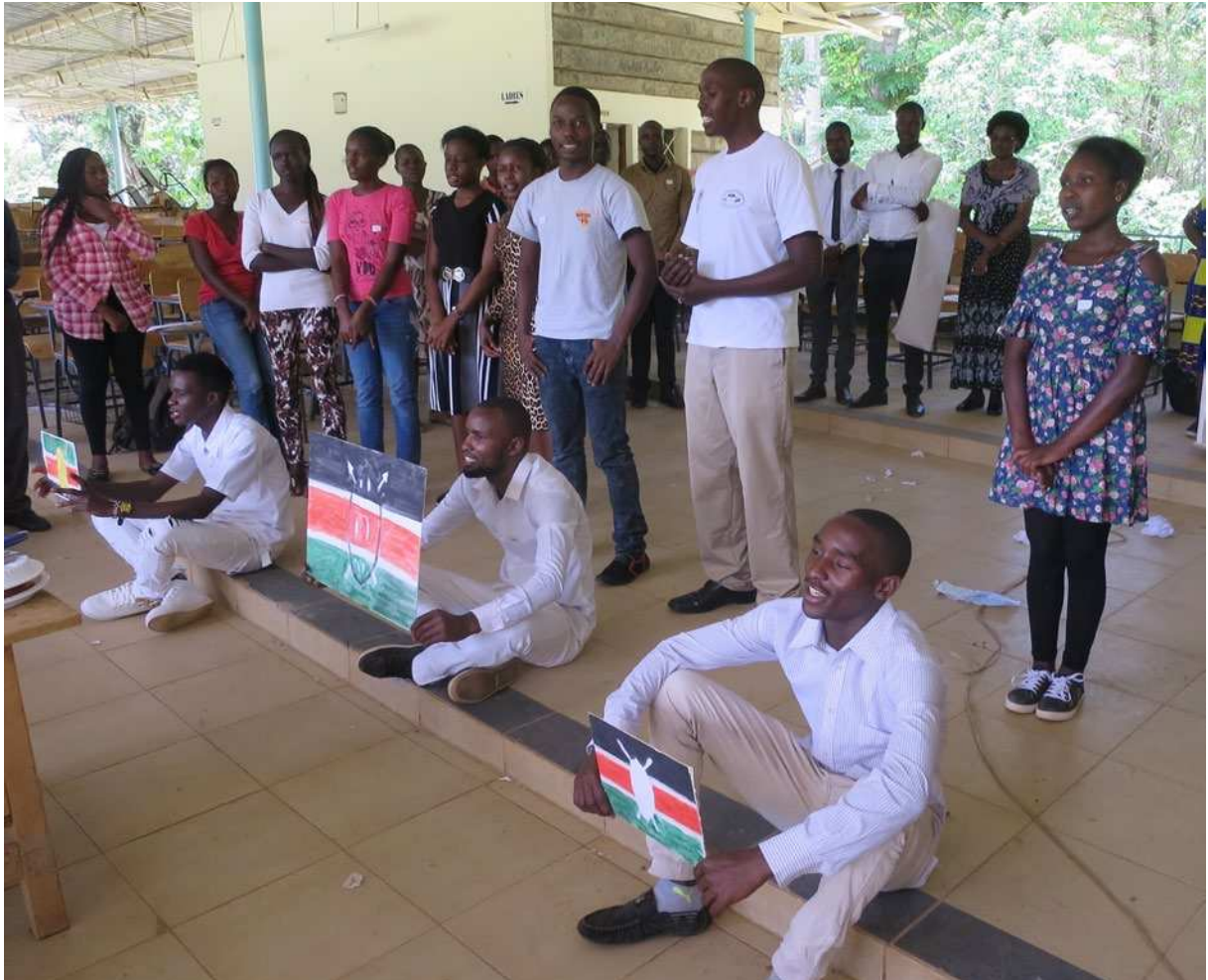
Students from Maseno University created a peace ceremony, using poems, symbols, illustrations and the Kenyan flag. Time Travel on the post-election violence 2008.