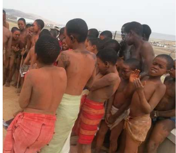
The hunter-gatherers finding their land occupied by the farmers. Time Travel in Ingula.

The activities in the Time Travel method have not only provided the opportunity to discuss questions related to a specific theme within a smaller group. It has also provided in South Africa, at least in KwaZulu-Natal, an opportunity for participants to use old and new technology. We have in Time Travelling, used sickles, cast iron pots, pressure stoves, paint brushes, shovels and picks Mpophomeni.