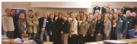
Participants of the first Bridging Ages conference in Vimmerby 2004.

method change gradually. Contemporary issues became more and more into focus. Key questions and safe spaces for reflection were introduced (presented later in this text). There is no doubt, that there was a paradigm shift in the Time Travel method from just learning about history to learning something about today's society, through history. In an expert seminar in Pretoria, South Africa, in 2016, the Bridging Ages countries agreed on the definitions and principles, process and event of the Time Travel method.