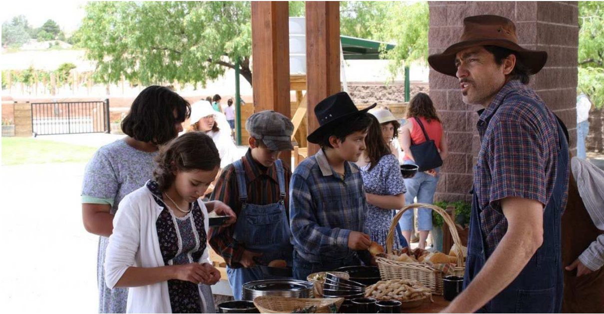
Time Travel to the Great Depression 1936 at the New Mexico Farm and Ranch Heritage Museum.

ly two hours and I stayed in character the entire time, working to make the Time Travel experience as immersive as I could for the excited students.