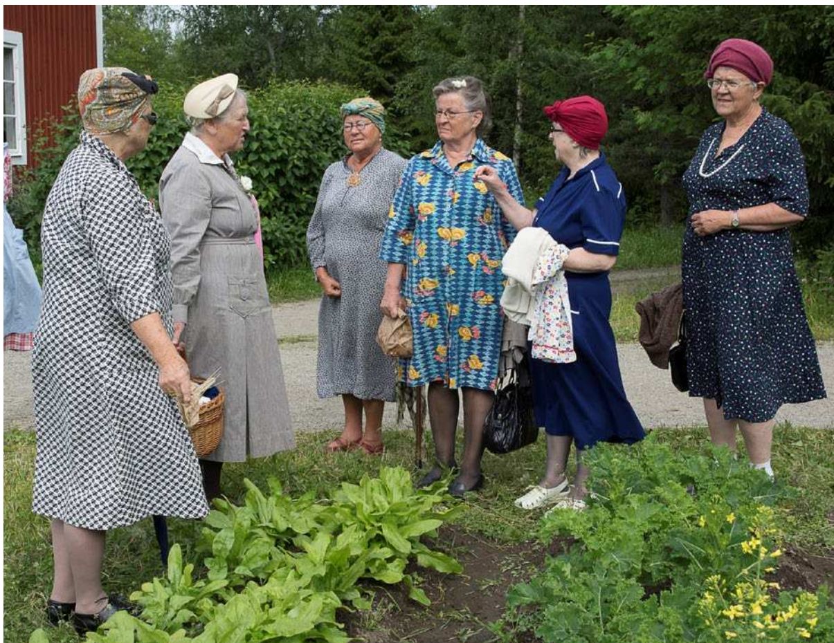
Every summer during the Historyland season, volunteers arrange meetings to different historical times. Here are the housewives meeting in the Per Albin-farm from 1942. The housewives inspect the vegetable garden.