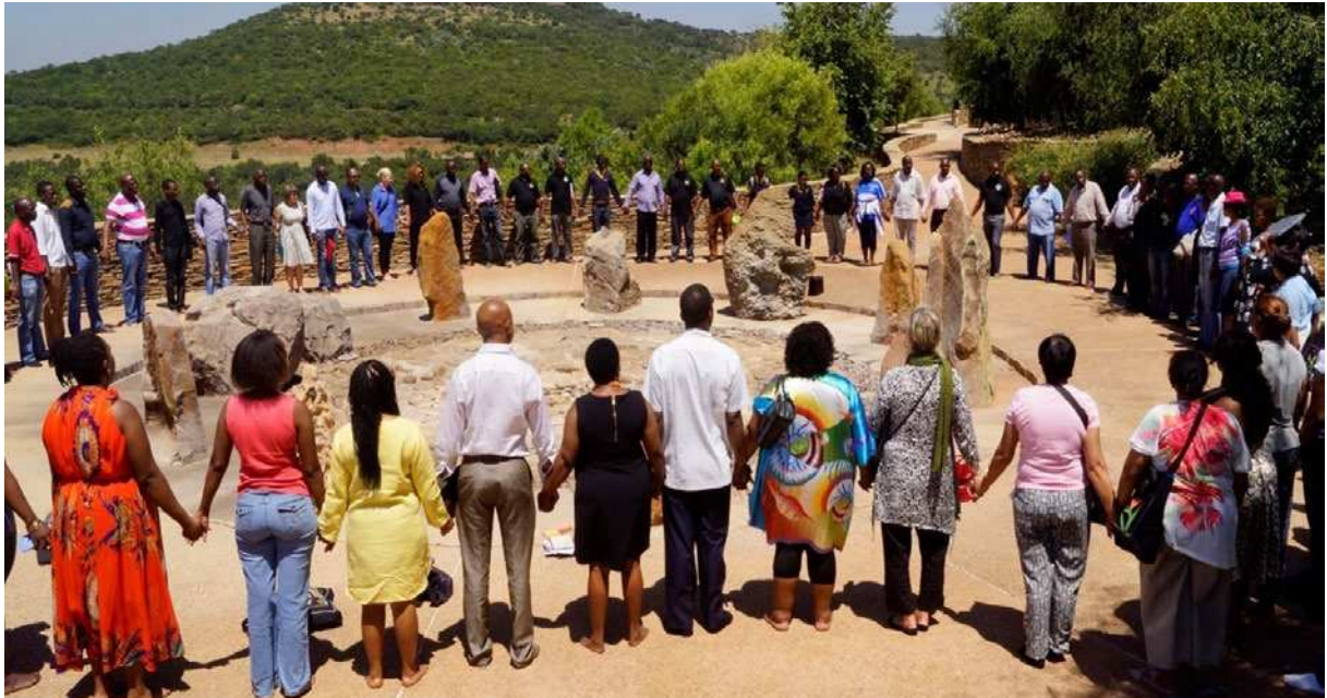
Ceremonies are important in Time Travels. A spiritual healing ceremony on the Mamelodi massacre (1985), at the Isivivane, Freedom Park, Pretoria.

people have taken part in Time Travel events. The concept has widened within the last ten years and today it includes many programs, using heritage to reflect on contemporary issues. There are many engaged people in the Bridging Ages groups all over the world and there is excellent team work. It is obvious from the evaluations, that Time Travel programs and events make a difference for many people.