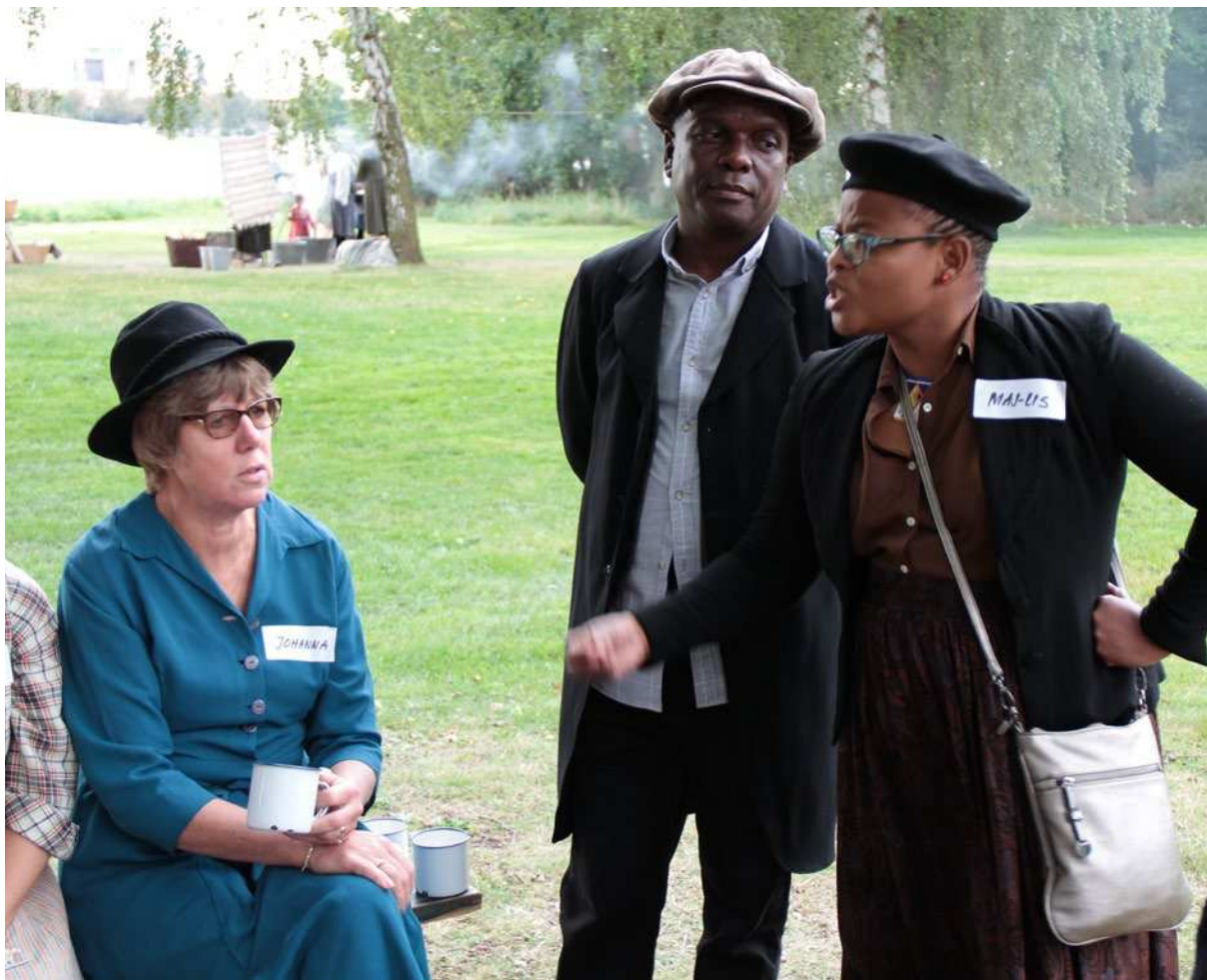
Key questions on values and morals release engagement. A Time Travel event in Kalmar to 1945 on the local communities receiving refugees, “we” and “them”.