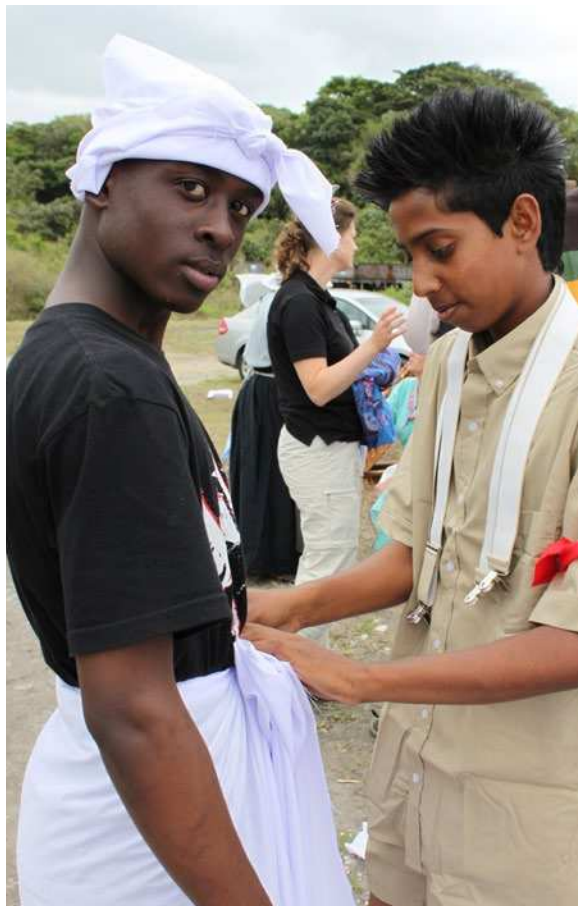
Time Travel with learners at the old harbour in Port Shepstone, 1905. Learners from several schools are mixed in the events. Indian can play African, African can play Indian.

”All my views changed when I experienced my first Time Travel event – being in the time capsule allowed me to go through a little bit of the past and stirred up all kinds of emotions. Seeing how people were treated in that time period and the challenges they faced brought tears to my eyes. The Time Travel method is unique. My personal opinion is that it is good exercise for all South Africans to experience.”