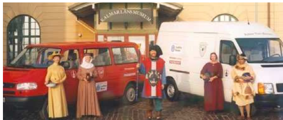
Kalmar County Museum uses buses for transporting props and costumes to Time Travel sites.

In 2006, Kalmar County Museum was invited to South Africa and started collaboration projects on the Time Travel method. The realization that heritage was very much connected to the society of today in South Africa made the Time Travel