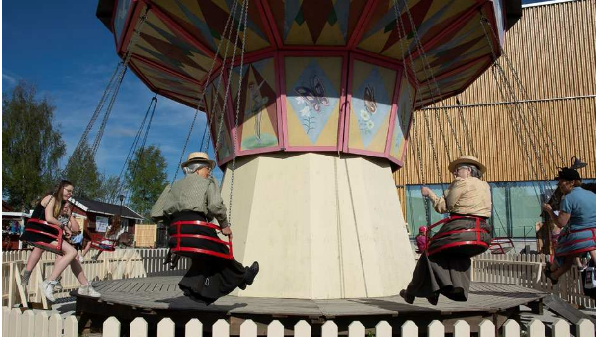
Volunteers acting 19 th century ladies at Jamtli's spring market, taking a ride in Jamtli's carousel.

who help with identification of long forgotten motives in photo collections and many older adults have preserved competences from different crafts which seem obsolete today. Preservation of some crafts has become dependent on competences which were taught and learned decades ago by now older adults. Museum professionals may be especially tempted to think of carpenters, black-