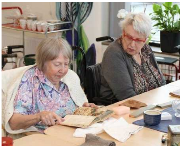
Simple activities can make a difference in everyday life at elderly care centres.

day life for the elderly (Gustafsson 2016). Finally, the staff are now carrying out their own Time Travels with the elderly in their own ways. At one Time Travel they organized a dance in the park and cruising with American cars from the 60's. Of course, there are also other factors than Time Travelling contributing to these positive changes of attitudes. However, the museum is happy to have played a part in this development through adding perspectives and experiences that employees in Swedish elderly care otherwise rarely have access to.